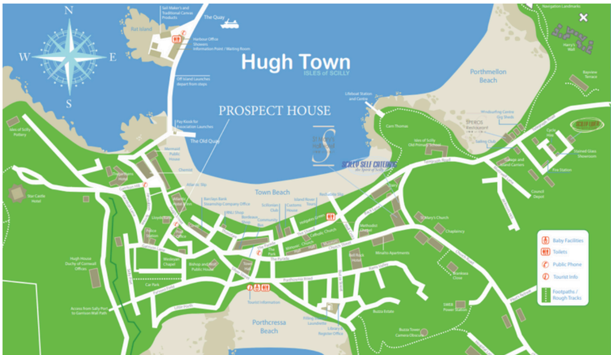
Map of St Marys

Directions from the Quay | Walking time: 5-6 minutes